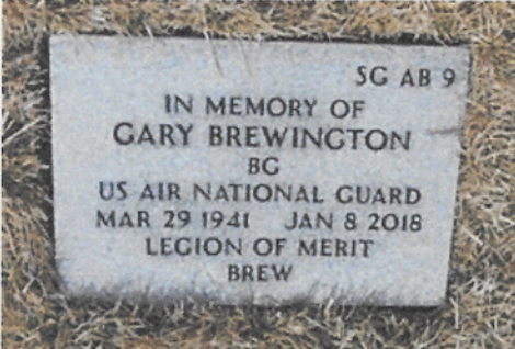
Added by thomasbiggins